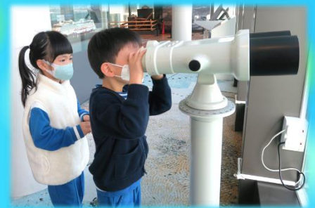
Visit the Hong Kong Maritime Museum