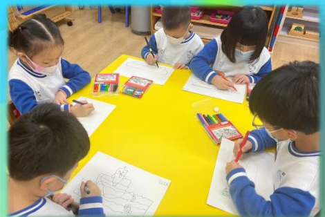
Designing "kind animal" transportation vehicles