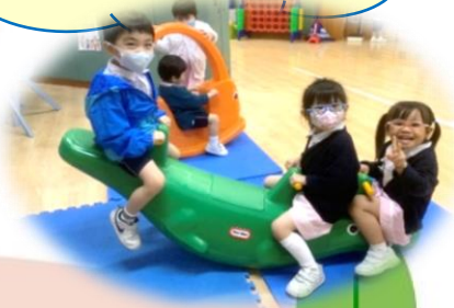
Having fun playing on the see-saw