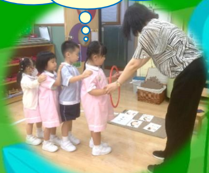
Having fun in class