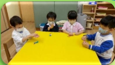
Light clay figures