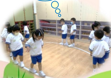
Walking along the line