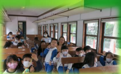
Visit the Hong Kong Railway Museum