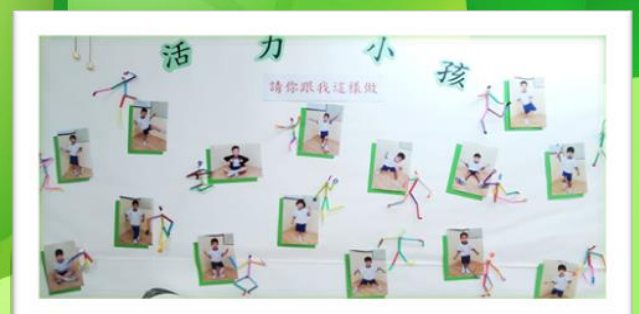
Please do this with me