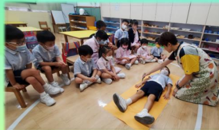
Knowing the various parts of the body