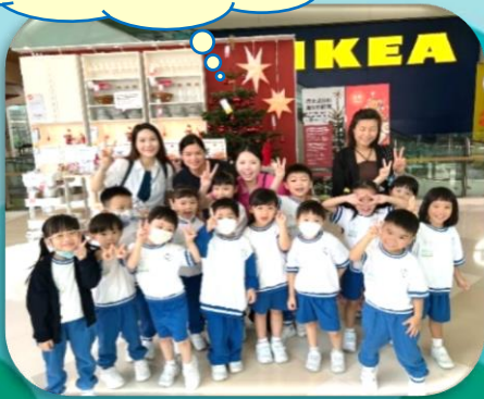
Visit IKEA store

Children, in this theme starting with the story of Noah obeying God and building an ark, they explore their family members and relationships, and each person's role at home. Then starting with the environment and activities at home they explore the concepts of geographical location and time, and then discuss the pets and plants at their home. So children learn about their home from different perspectives: geography, history, animals, plants, and learn from the words of the Bible that the key to a blessed family is to obey and follow God's words.